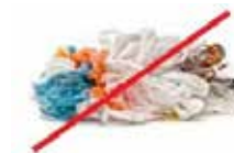
NO Plastic Bags or Film Plastic – DO NOT BAG RECYCLABLES