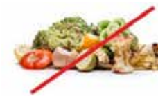
NO Food Waste